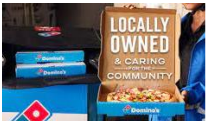
Domino's Pizza Bunbury

Without the support of our sponsors BUSC would not be able to grow and move forward. Please support them and mention BUSC when using these businesses.