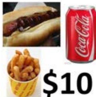
Hot Dog Combo

Meat Pie + Chocolate + Can of Cool Drink